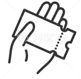
1( ticket )