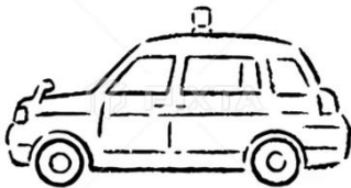
4( taxi )