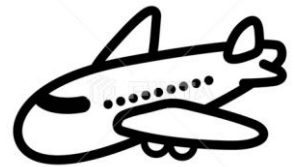
3( plane )