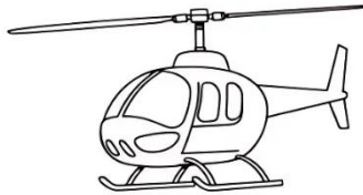
2( helicopter )