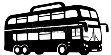
6( coach )