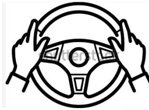
5( steering wheel )